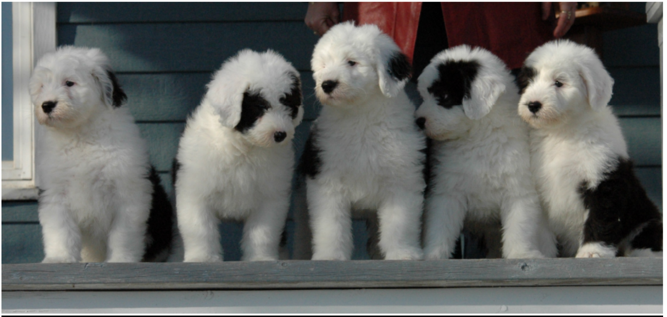
Valubal Old English Sheepdogs